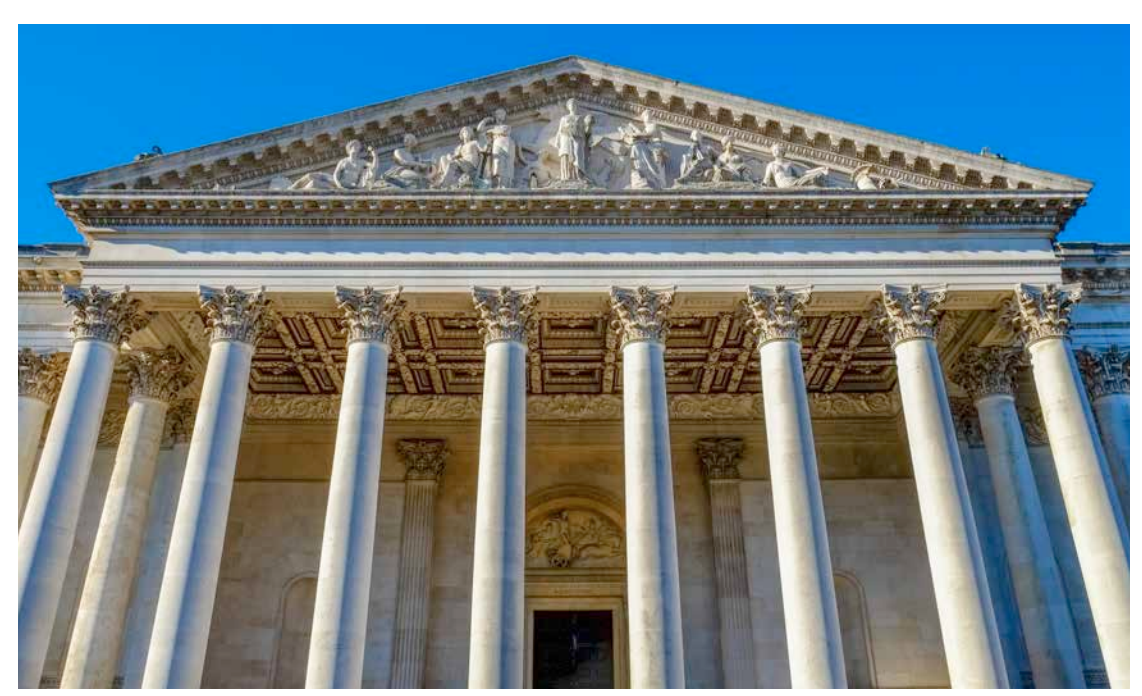
Fitzwilliam Museum, Cambridge

18.30 – 19.00 Tour of Fitzwilliam Museum