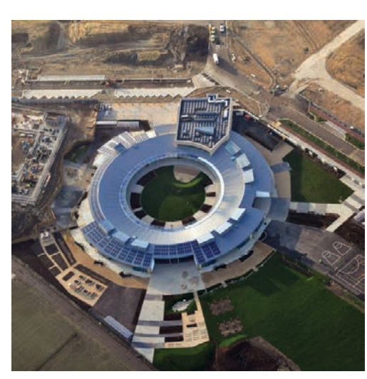
Cambridge University Primary School